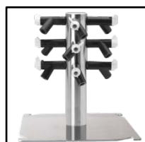
Vertical Manifold 12-Port Stainless Steel Vertical Manifold