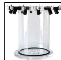
Vertical Drum Manifold 8- or 12-Port Acrylic Drum Manifold

† The specified Maximum Ice Condensing Capacity in 24 Hours and Maximum Deposition Rate are based on the process of freeze-drying water as aggressively as possible. The freeze dryer's ability to collect ice at an hourly rate or over a specified period will always be application dependent.