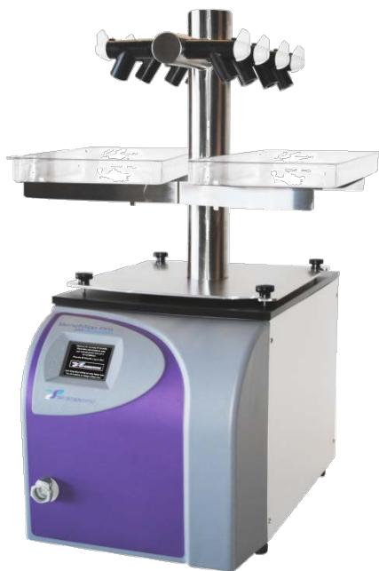
(BenchTop Pro 8L with optional tree-type manifold and condensate pan kit shown).