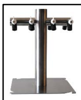
Tree-Type Manifold 8- or 12-Port Stainless Steel Manifold