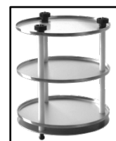
Bulk Shelf Rack 3 Shelves; Unheated or 35 °C Heated