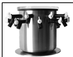
Drum Manifold 18-Port Stainless Steel Drum Manifold