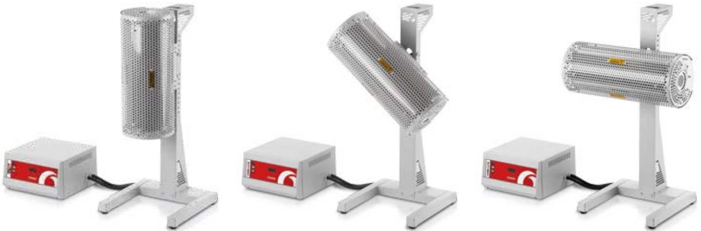
EVA 12/300 Angle adjustment option allows horizontal and multi-angle configurations

EHA, EHC, EVA, EVC – Compact Tube Furnaces