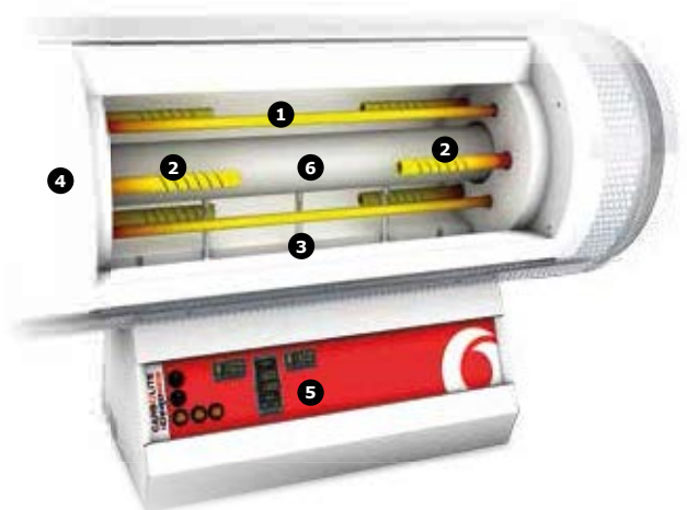
TZF 15/610 with 3508P1 programmer