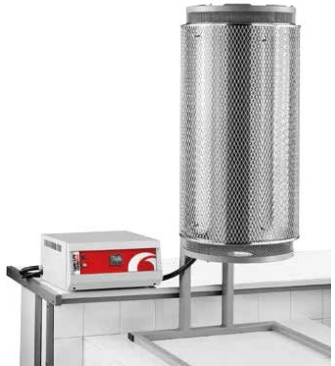
STF 15/610 with 3216P1 programmer and L stand options

The Carbolite Gero STF single zone and TZF 3-zone high temperature tube furnaces are available at 1500°C and 1600°C with both models using silicon carbide heating elements.