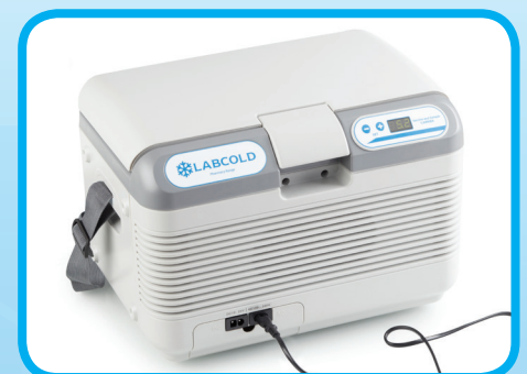
Hygienic easy clean exterior