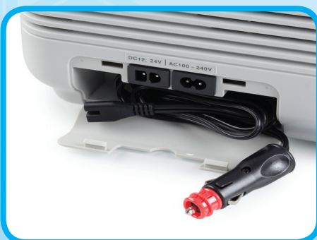
Handy compartment for vehicle cable